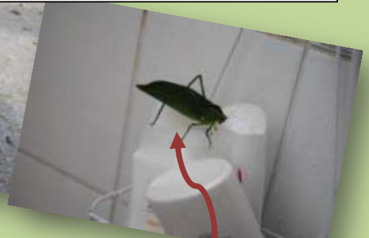
SMALL BUG FOUND IN SHOWER.