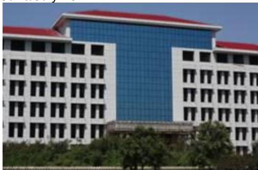
New Xinyang SWI

This month we began renovations in the new Xinyang CWI. They are moving to a newly built facility. This will enable us to expand our Center there from 18 beds to 45 beds. We will occupy the top floor of the building. We have also been asked to train the nannies in the Xinyang SWI and we will try our best to make this happen. The new SWI is likely to be opened in June/July 2012.