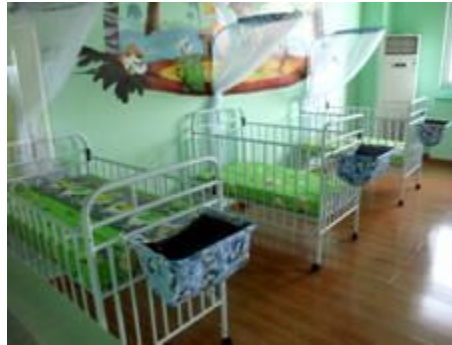
Jiaozuo SCU Green Room