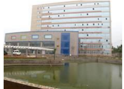
New Jiaozuo SWI