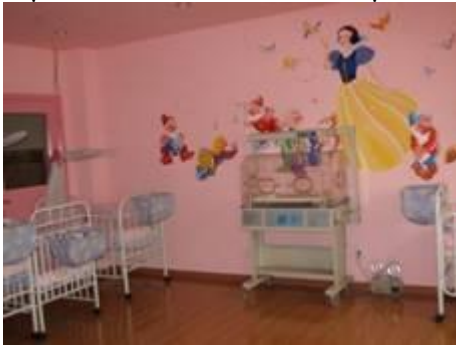
Jiaozuo SCU Pink Room.