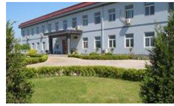
Hope Healing Home Beijing

www.hopefosterhome.com Mobile 13801351244