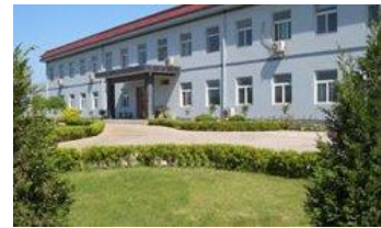
Hope Healing Home Beijing

www.hopefosterhome.com Mobile 13801351244