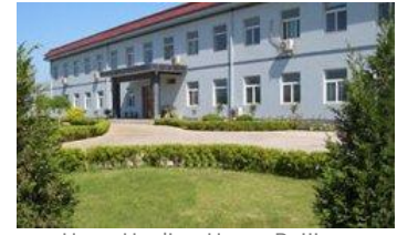
Hope Healing Home Beijing

www.hopefosterhome.com Mobile 13801351244