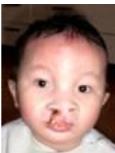
Jericho (Cleft surgery) in Hong Kong, travel only for child and escort $1300